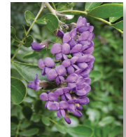
Texas Mountain Laurel ( Sophora secundiflora )