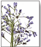
Chinaberry Tree ( Melia Azedarach )