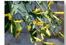
Tree Tobacco ( Nicotiana Glauca )