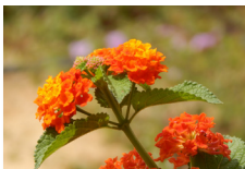
Lantana ( Lantana sp. )