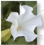
Jimson Weed ( Datura Stramonium )