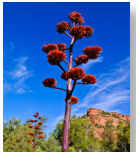
Century Plant ( Agave Americana )